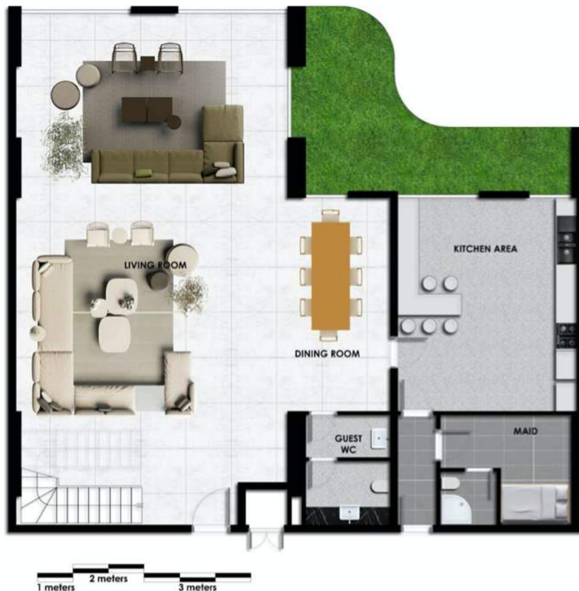
TABLE OF AREA DUPLEX TYPE C: 1ST FLOOR