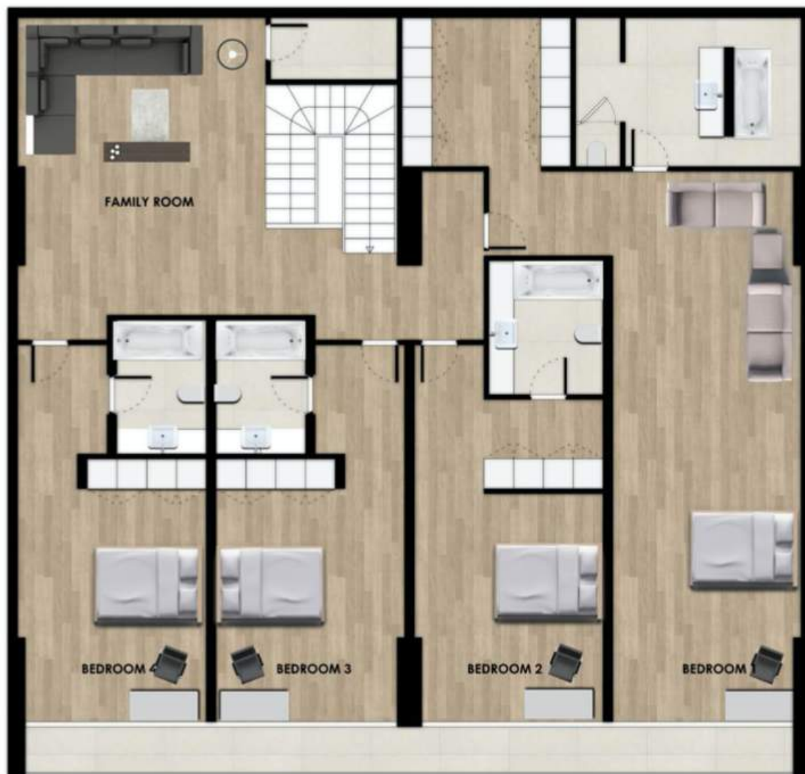
TABLE OF AREA PENTHOUSE TYPE P5