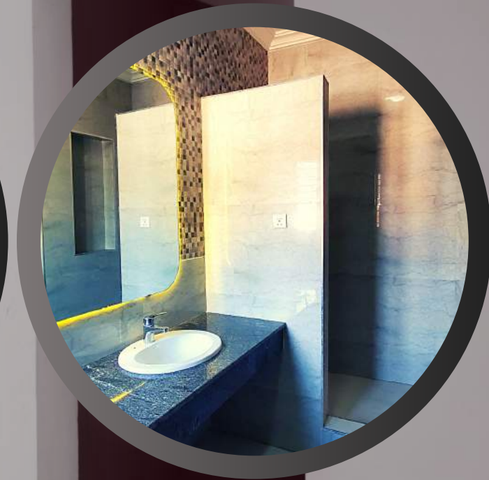
ROOM, WALK-IN-CLOSET, BATHROOM